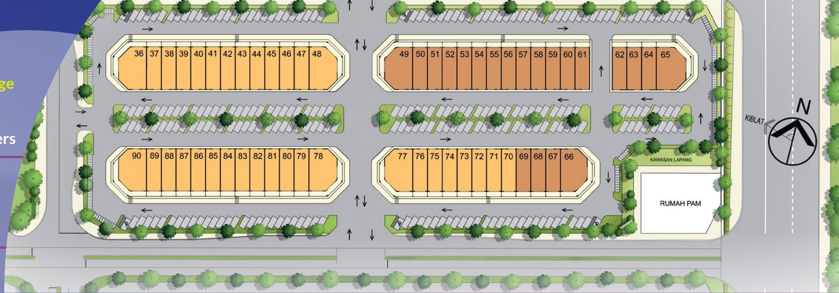
1-Storey Commercial Shops Lot Size: 20' x 65' Built-Up Area: 1,160 sq ft

Well-planned traffic flow to all commercial shops