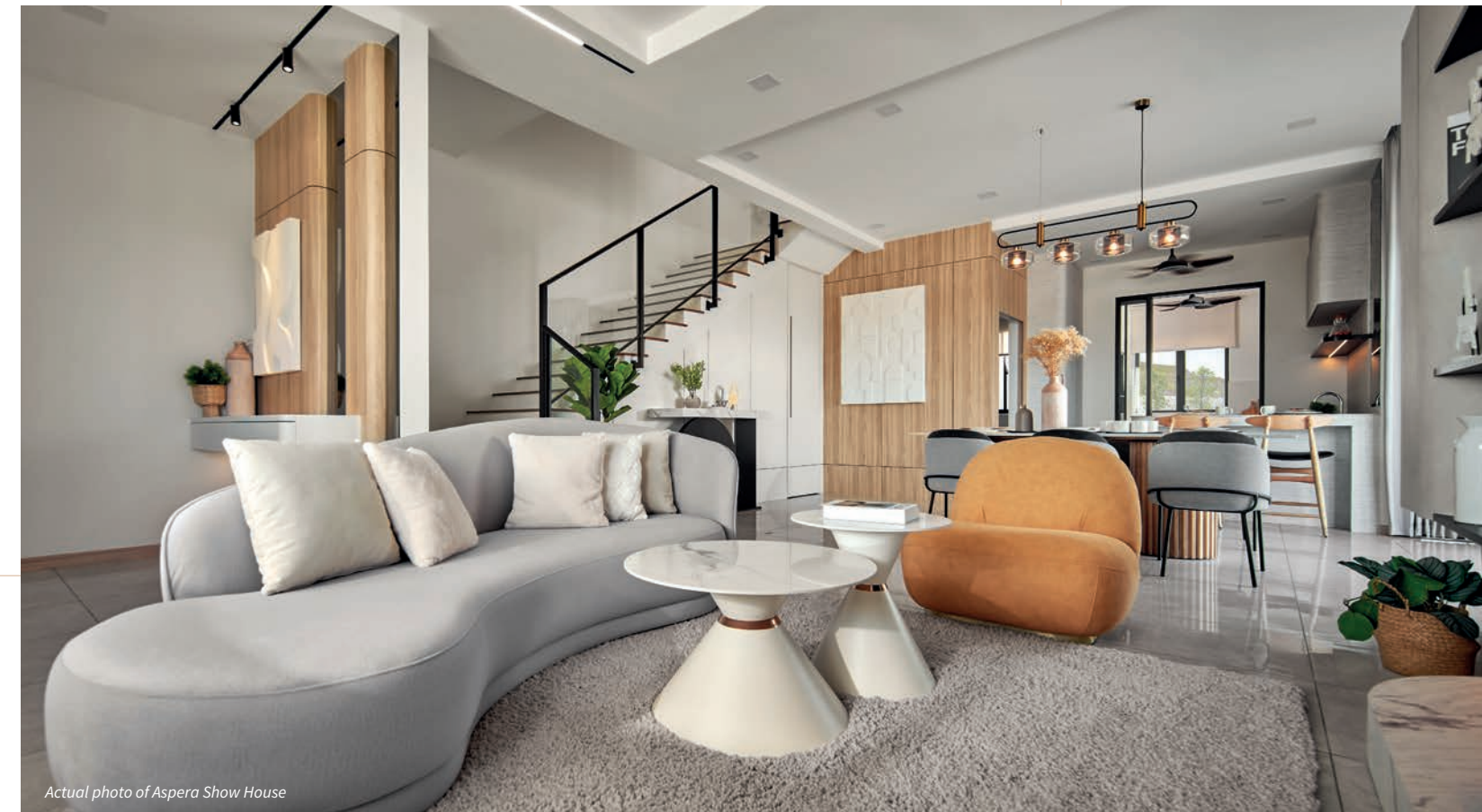
Actual photo of Aspera Show House