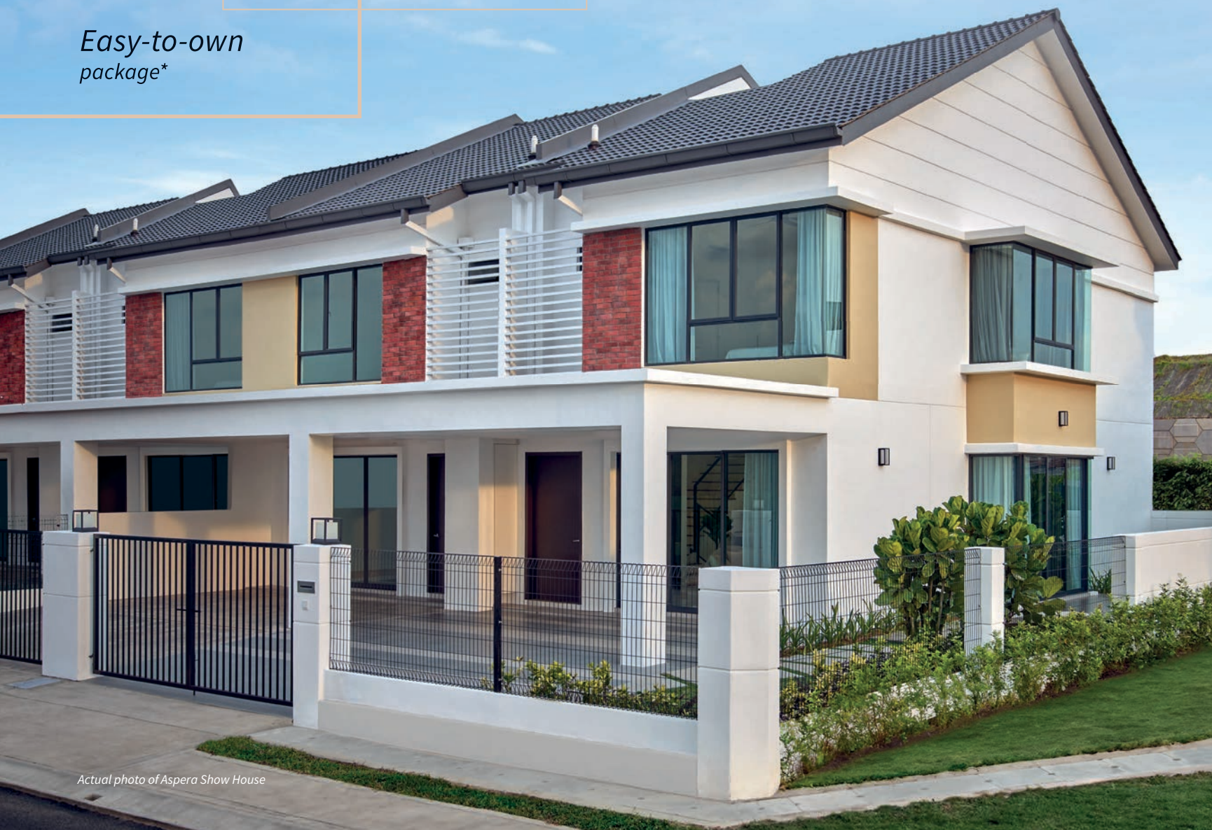
Actual photo of Aspera Show House