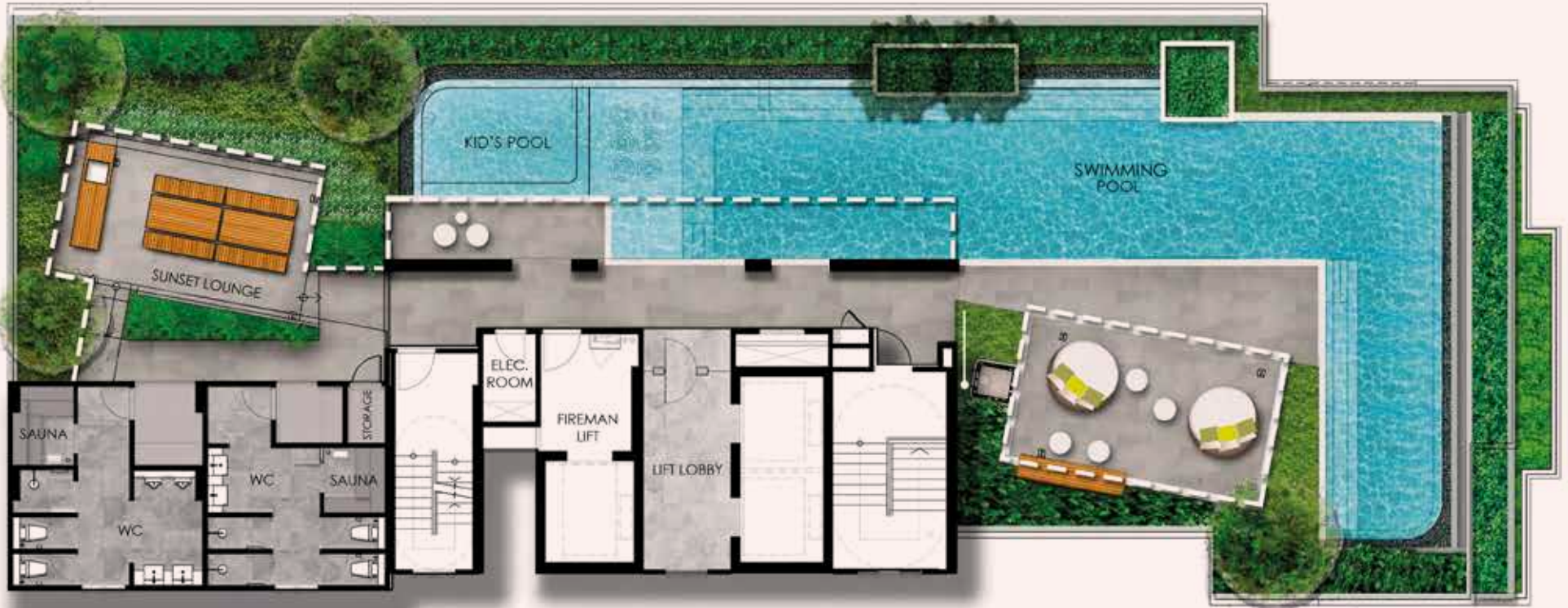
FLOOR PLAN 29 th Floor