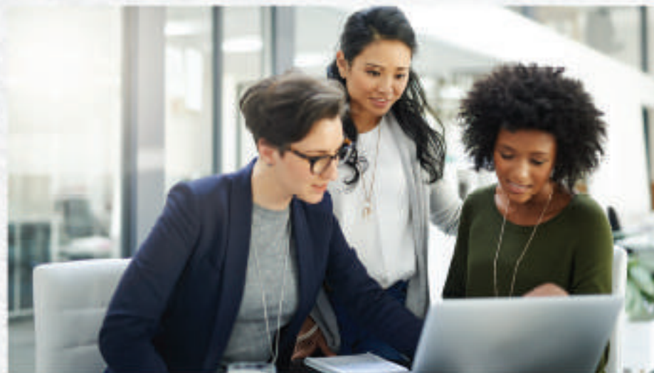
Local and international companies alike are flocking to Cyberjaya for its continuous innovation and IT infrastructure.