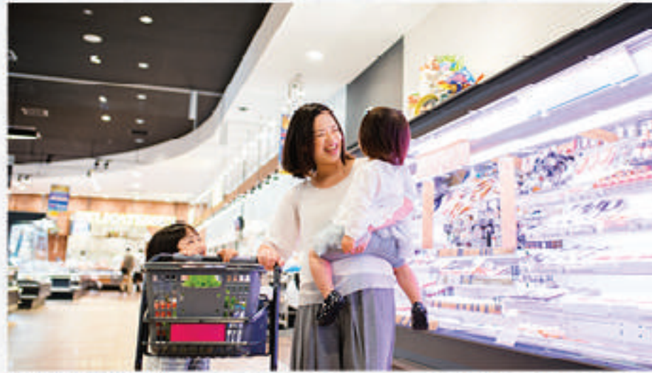
Have every need fulfilled without needing to leave the city — from retail and dining to banking and healthcare.

Located within the Cyberjaya Flagship Zone, Sejati Lakeside will be a part of the fast-growing global technology hub that is constantly evolving. Fully equipped with the best infrastructure, the city links to major expressways and is served by both bus and transit systems for accessibility.