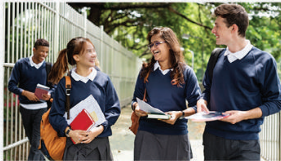
A great place to grow up, Cyberjaya is equipped with education institutions of every level in a variety of fields.