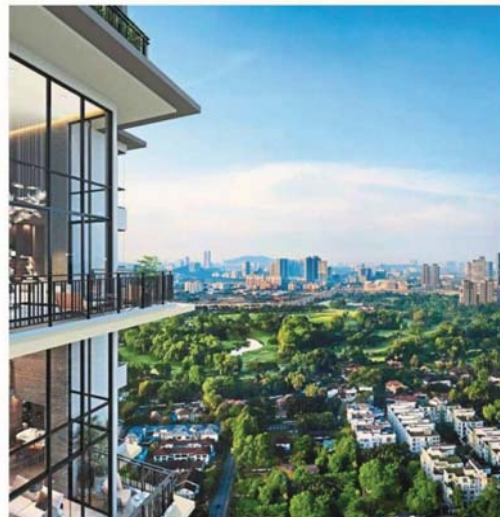
Savour the scenic charm of the Royal Selangor Golf Course view.

Register your interest and visit The Ashwood show units at https://paramountproperty.my/the-ashwood