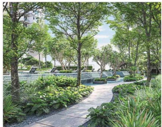
(Pic above) Take a stroll at the Garden of Serenity while enjoying the cascading waters.