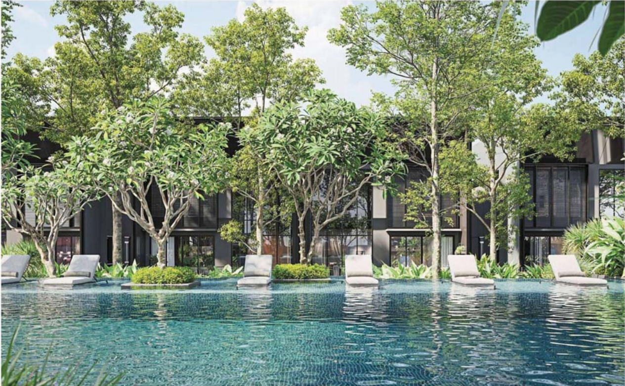
Dive into refined leisure at the poolside lounge.

timeless aesthetics with cutting-edge smart home technologies.