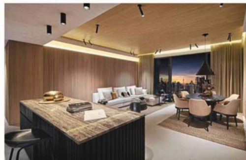
Enjoy wide living and dining space with the majestic KL cityscape view.