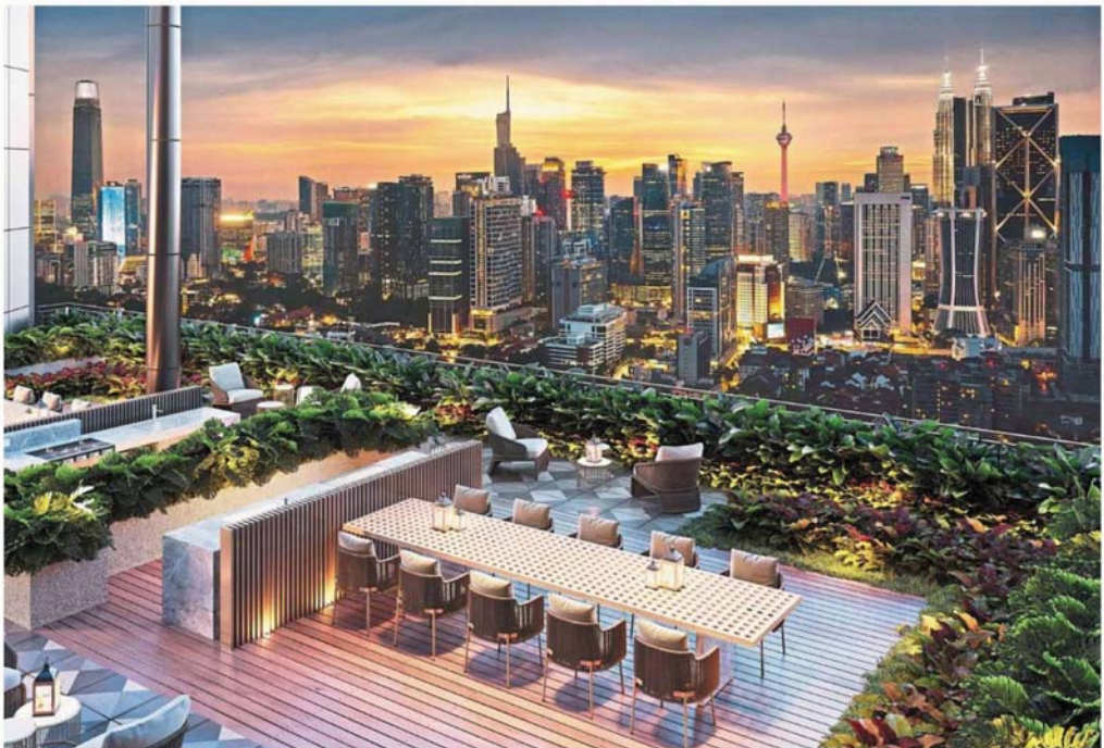
Embrace resort-style living at its finest, only 1.8km to the KL city centre.

Paramount Property unveils its long-awaited masterpiece, The Ashwood – serene living with stunning KL cityscape and golf course view